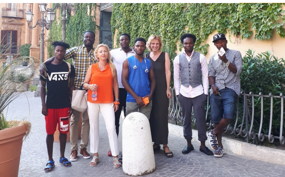
Picture taken in front of Agrigento Town Hall

However, there is a strong need to make collaboration between services, public as well as private social, more fluid and effective, at a time when the rapidly changing context poses important challenges.