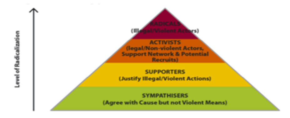
Fig. 2 Pyramid with levels of radicalization

From Moghaddam American Psychologist 60, 2005